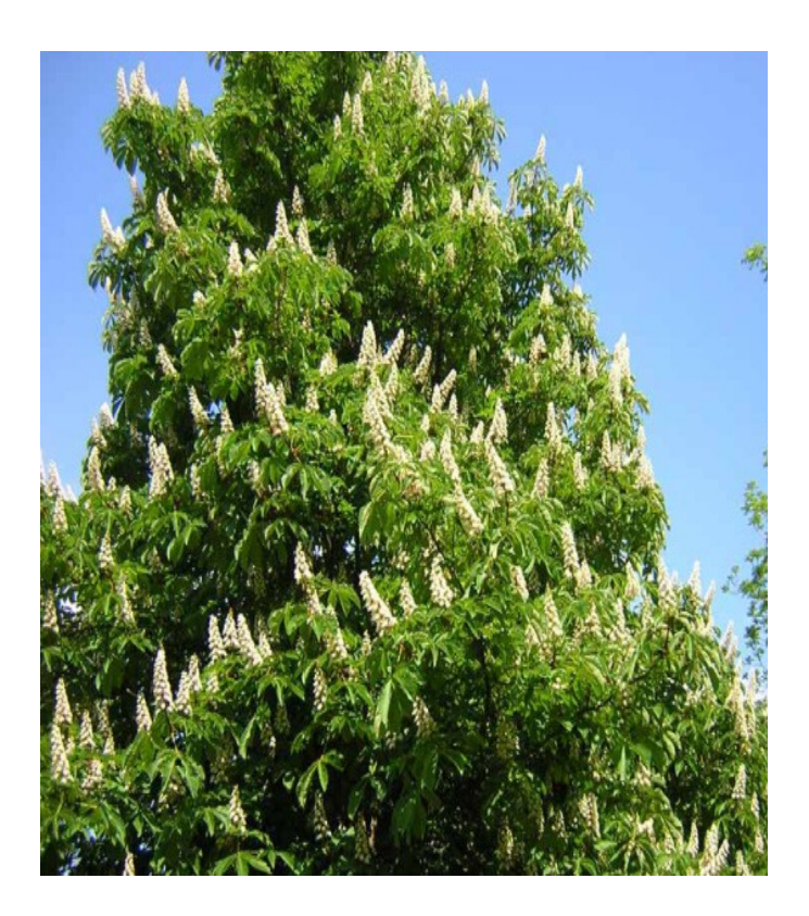
hippocastanum, Indian Chestnut, Horse Chestnut

Origin: the cool, humid mountains which separate Albania and Macedonia from Greece. Majestic deciduous tree with round or ovoidal crown. Compound leaves which turn yellow in autumn. Flowers grouped in upright, pyramidal racemes, white and spotted with pink and red at the base. Prickly fruit, which contain one or two shiny brown seeds. This plant is ideal for countries in North Europe or for the cool mountain valleys of Italy. It adapts to various types of soil except if too compact at the surface. .